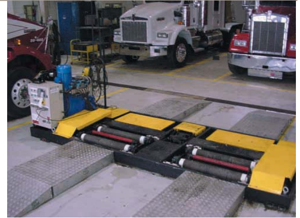
Low profile VIS-Check conveniently mounts on the floor of a conventional service bay.