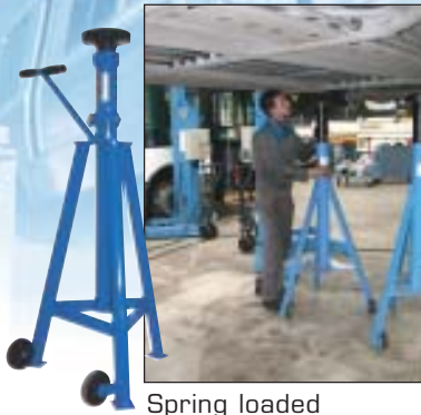
Spring loaded support stands.