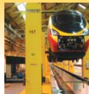
United-Kingdom - 15 t.