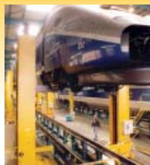
France - 20 t.