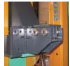
Interchangeable lifting claws.