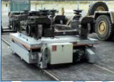
Bogie transfer table.