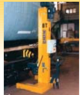
France - 8 t.