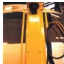
Large handles for easy lift handling.