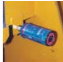
Automatic lub pots.