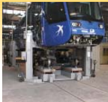
France - 5 t.