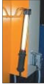
Portable work lights.