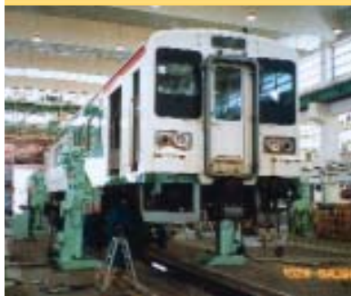
Japan - 10 t .