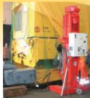
Switzerland - 25 t.