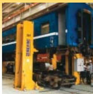
Taiwan - 25 t.