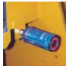
Automatic lub pots.