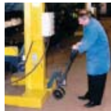
Hydraulic tow handle with safety release.