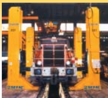
France - 20 t.