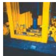
Hydraulic pump with safety.