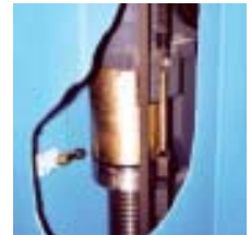
Lifting synchronization system.